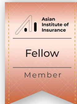
Your Verified FAii e-Badge Upon Completion