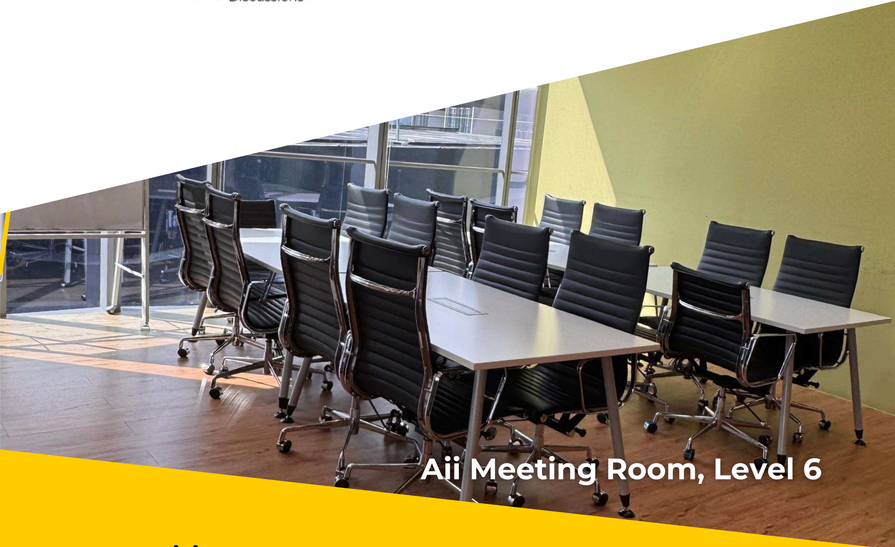
Aii Meeting Room, Level 6