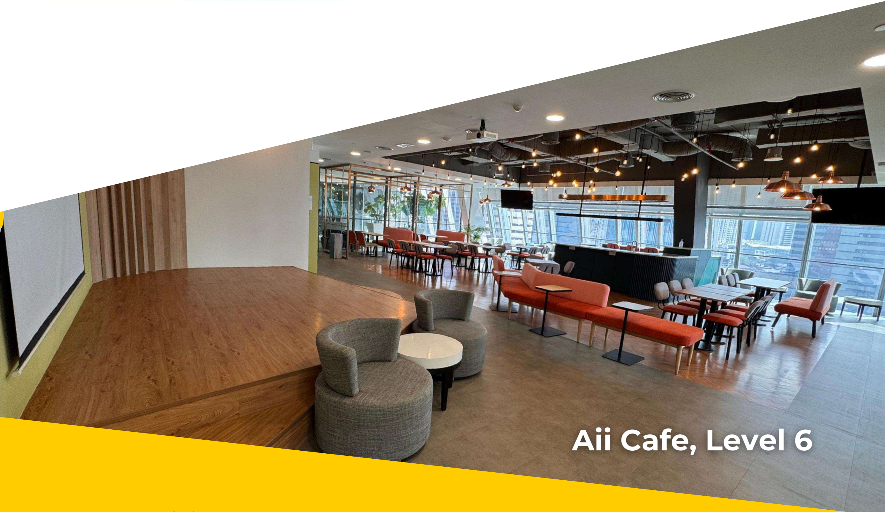
Aii Cafe, Level 6