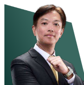
Chief Engineer Universal Studio Singapore