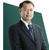
CEO of PNB Merdeka Ventures