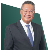
CEO of Far East Hospitality