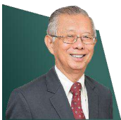
Former Group President, GIC Singapore

With a diverse array of leading experts in their respective fields, you can confidently transform learning into practical and relevant applications. From shaping public policy to securing national defense, from fostering business excellence to navigating the digital impact on the insurance industry, these esteemed leaders share invaluable life experiences, illustrating what a successful future in business looks like.