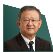
Former Group CEO, AIA Group