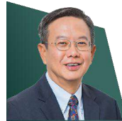
Former Dean of NTU Business School