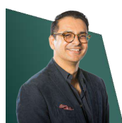
Group Head DBS Innovation Hub