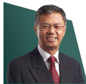
Vice Chairman of RJE & Chairman of APRIL Group